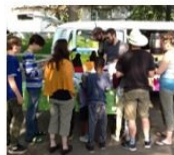
Skills Society Tea Van