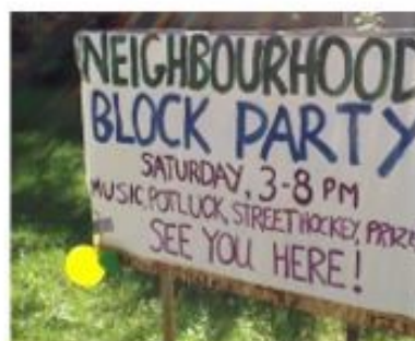
Block 34 Party Sign