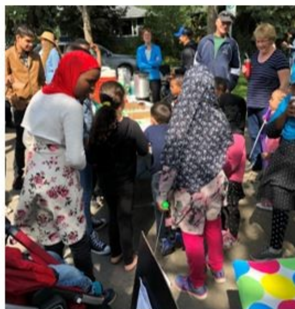
Block 23/20/13 Party